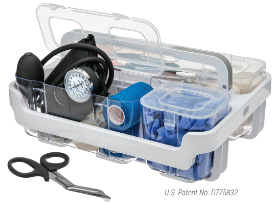
U.S. Patent No. D775832