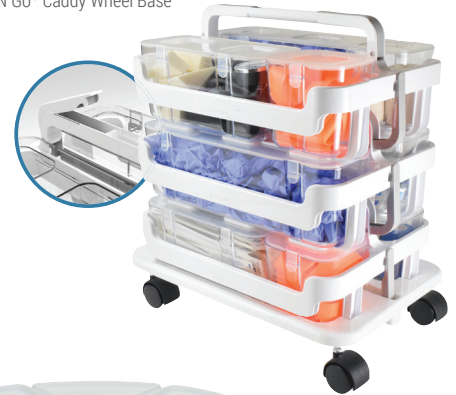
Lift & Lock Levers